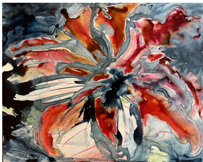
4. Mahogany , Anita Ewing (Mixed Media)

Additional images are available. All images are also available at larger resolution sizes for publicity purposes. Please send image requests to Jen Sheckels at muddycreekartists@gmail.com .