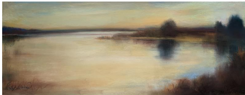
2. Calm , Roxanne Weidele (Pastel)